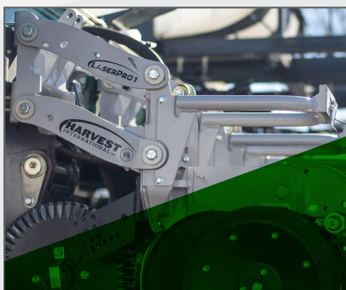
SEED BOX BRACKETS, ROW LOCKUPS, VAPPLY MODULE BRACKETS, ETC ARE AVAILABLE.