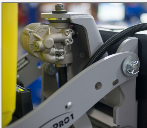
BUILT-IN DELTA FORCE OR AG LEADER HYDR DOWN FORCE BRACKETS

*COMPATIBLE W/ GREEN XP SHANK. MORE COLOR & MODEL COMPATIBILITY COMING FOR 2019 PLANTING.