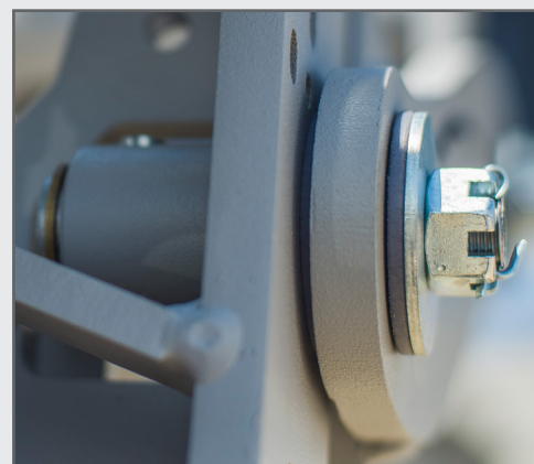
DRY-LUBRICATED POLYMER BUSHINGS W/ THREADED 1" SHAFT FOR FAST ADJUST